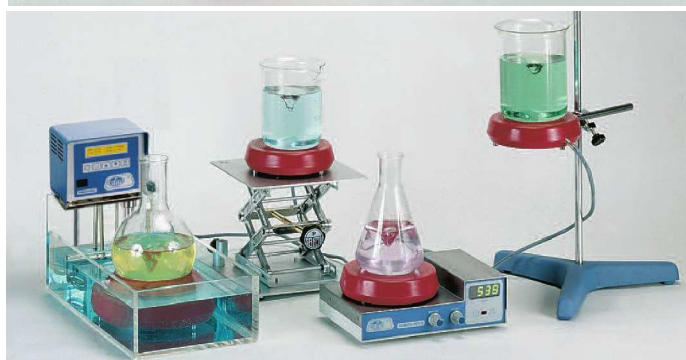
Example: system of submerged stirrers table top and with retort stand.