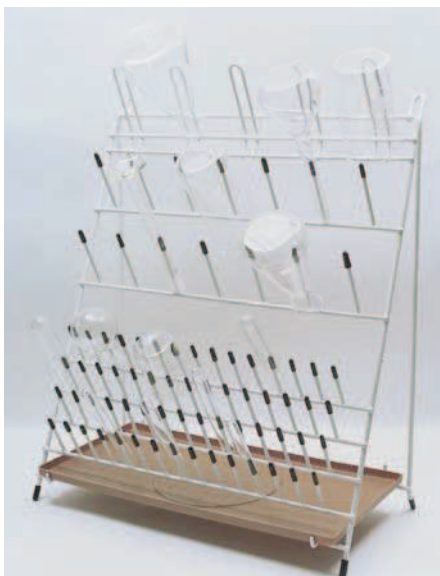
TABLE TOP OR WALL MOUNTABLE DRAIN RACK

Made of moulded rubber (E.P.D.M.). Temperature resistance up to 100 °C. Specially designed with stepped surface to support different flask diameters. From 100 ml up to 10 litre capacity. Dimensions: 50 mm high x 160 mm Ø. Part No. 1000863