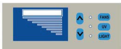
For Model: BBS-DDS/SDS