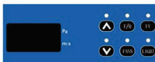
For Model: BBS-1300HGS/1800HGS